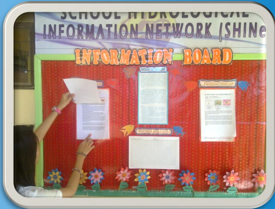
Updating the information board for more SHINe updates....