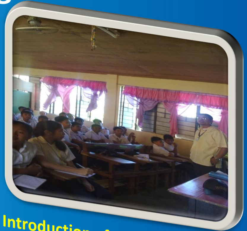
Introduction of PROJECT SHINe to the Grade 7 students.....