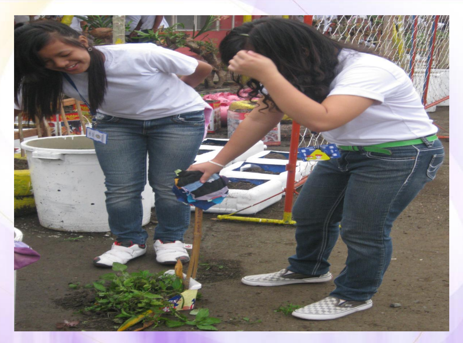
The clean up drive