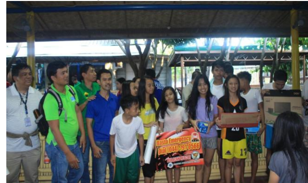
Cool SHINe Design shirts for the 6th SHINe Conference from various SHINe school groups