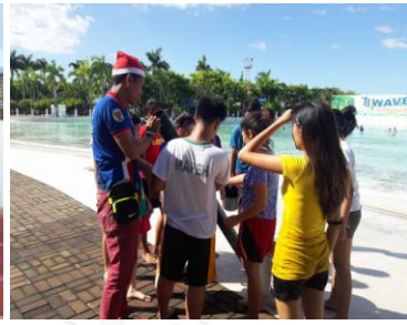
ANGAT NATIONAL HIGH SCHOOL