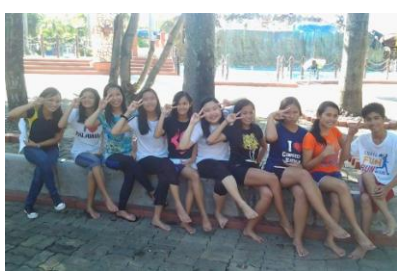
BINAGBAG NATIONAL HIGH SCHOOL