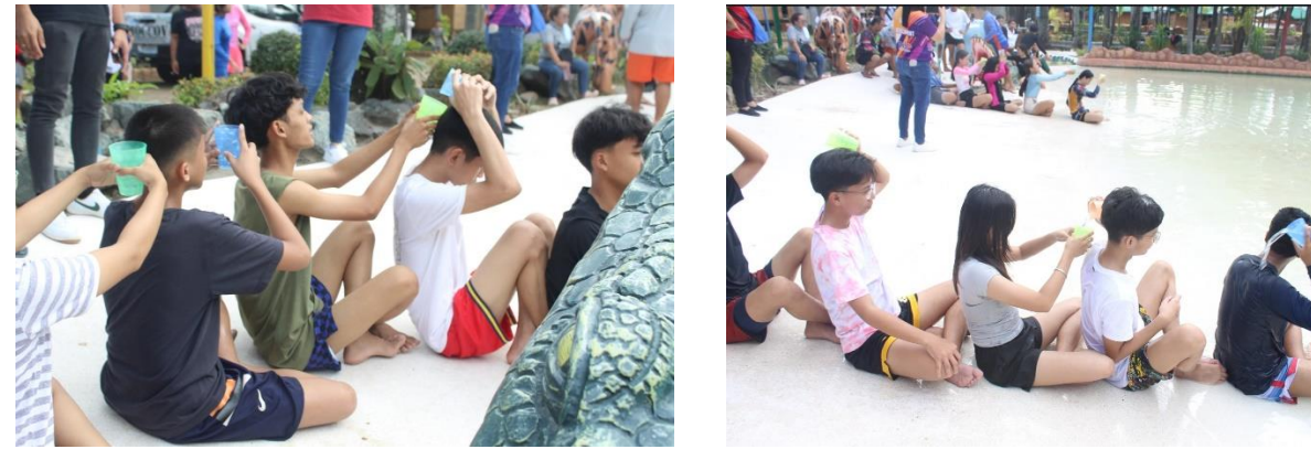
Focus and coordination are what it takes for the group dynamic game "fill my cup with water relay"