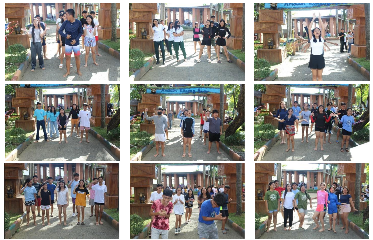
Above is a set of pictures showing the various SHINe groups as they bring out their talents in the impromtu group cheering competition.

The 3<sup>rd</sup> and the last part of the day-long activity was the school dynamics and the awarding of winners in the said dynamics. It was in the school dynamics where camaraderie, coordination and cooperation between SHINe school beneficiaries were mainly enhanced and developed. The individual groups were formed by joining 2 school groups who will interact and work together as they tackle the various activity challenges of the dynamics. Part of the activity challenges included impromptu group cheering competition, obstacle and water-related games. Below are a series of pictures highlighting the various school dynamic challenges.