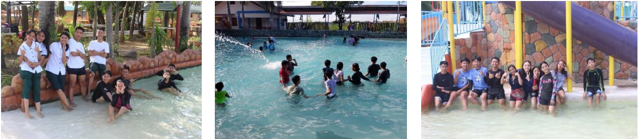
Finally, It's time to chill out and mingle in the swimming pool after the school dynamics... that was FUN!!

The group should have patience and perseverance when doing the "gem stone challenge" dynamics