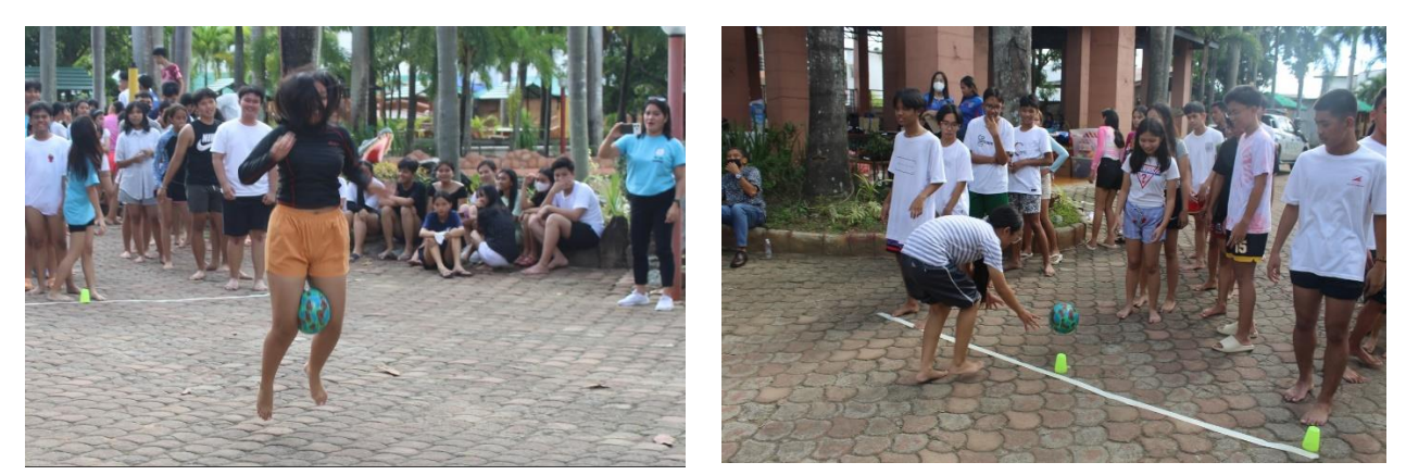
(above picture) Sheer knowledge (with questions and answers) and teamwork are necessary in the game "ipitin mo ang bola" race